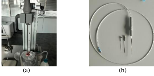
Fig. 1. Measurement set-up: (a) probe with the in vitro rat skin sample, and (b) three probes with 0.5mm, 0.9mm and 2.2mm diameters from left to right.